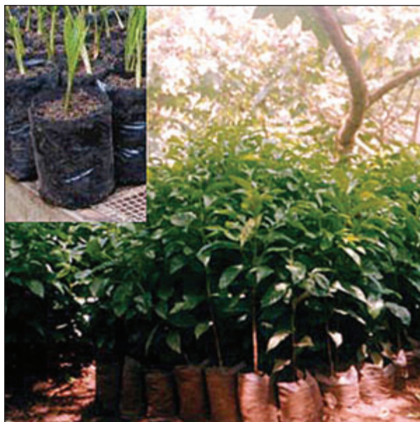
Fig. 2. The plastic bags where the plants have been grown in the nursery.

dial calipers and to the nearest 01 mm with measuring tapes after observing. After taking all the measurements frogs were released. After taking out all the eggs they were measured. After that all the eggs were kept the same place. Headlights were used at night (red color light).