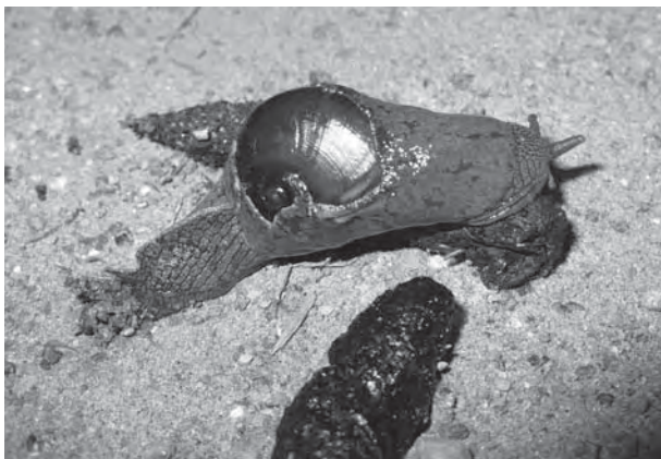
Fig. 02: R. irradians on the scats of Jackal

This is the first observation of E. carinata feeding on a land snail R. irradians . Further investigation is needed to establish if R. irradians is a regular item of the diet of E. carinata and to clarify what R. irradians feeds when on Jackal scats. Data on the diet and feeding habits of Sri Lankan and South Asian land snails or skinks are sparse and further observations are needed to verify their feeding habits. It is interesting to examine food and feeding habits of E. carinata on its range especially in