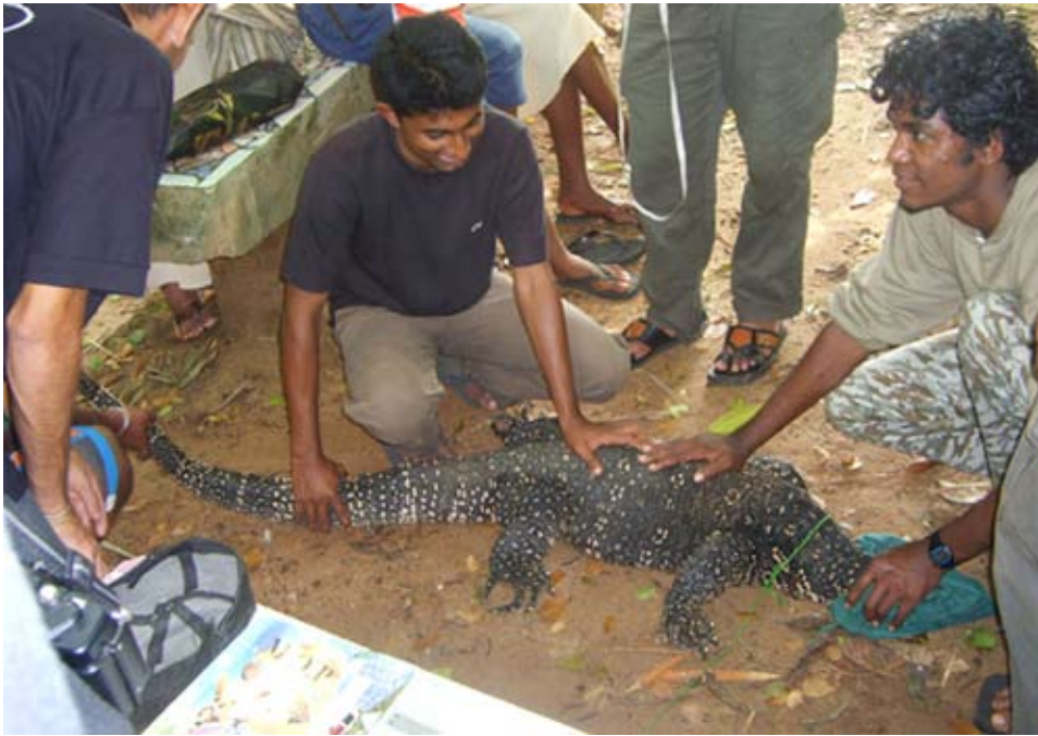
Fig. 3. Adult Varanus salvator .