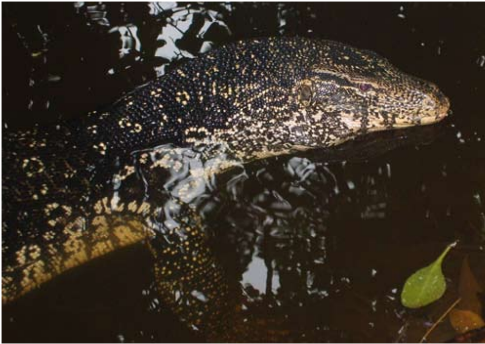
Fig. 5. Varanus salvator after release from fishing net.