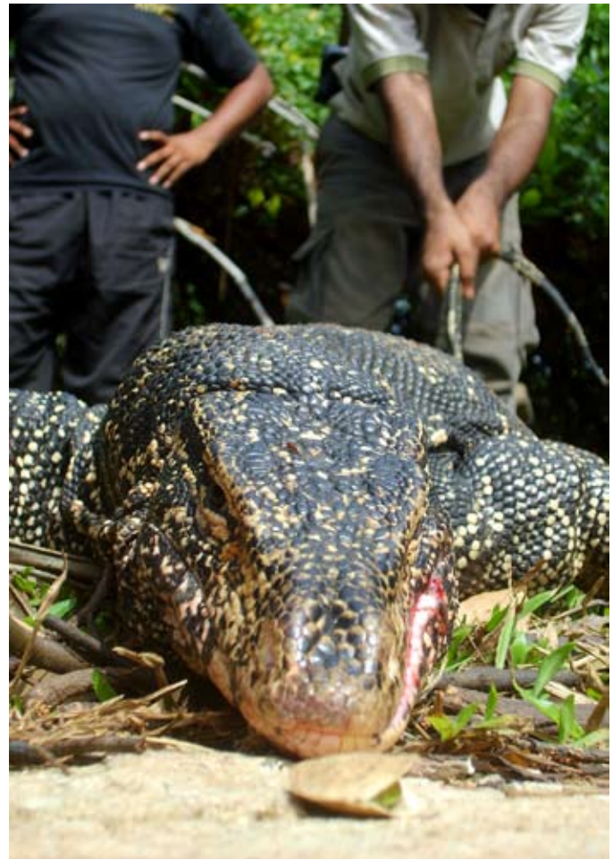
Fig. 4. Adult V. salvator found trapped in a fishing net, with an injury to its jaw.