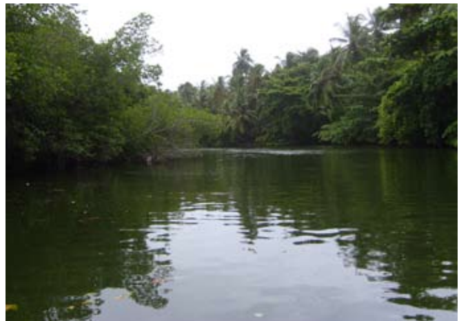
Fig. 1. Rathgama lagoon, Galle District, Sri Lanka.

Air temperatures were measured using a digital thermometer and the humidity was taken with a digital hygrometer. A 100 x 100 m area of the island was used a sampling site to determine the abundance and population dynamics of V. salvator . Ten observers were used to survey and each person covered 1000 m 2 . Some monitors were captured randomly for measurements, and then released. All morphological measurements were taken to the nearest 1 mm using a 1 m measuring tape.