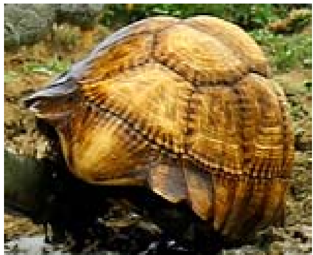
Fig. 1: The land tortoise consumed by the Mugger crocodile

There are several significant aspects to this episode. Firstly, we did not observe any damage to the carapace of the tortoise, even after the crushing force of the crocodile bite. Secondly, we were surprised how the tortoise survived around 30 minutes under water. According to Bonin et al. (2006), Das (1995) and Jayakar & Spurway (1996), Star Tortoises cannot swim and dive in water. Thirdly, the radiated tortoise in this instance coming towards the tank and feeding on the vegetation at noon in the hot climate of BNP is uncommon. The more usual active foraging times of the land tortoise are in the morning (06:00 to 08:00 hr.) and at dusk when the sun is not hot (de Silva, 2003). Possibly it could have come to drink water. Finally, the distinct carapace, body morphology and colouration of this particular tortoise was quite different to the common Star tortoise ( Geochelone elegans ), which is the native species widely distributed in the dry zone lowlands of Sri Lanka (Deraniyagla, 1939 & 1953; de Silva, 2003 & 2006) and common in the BNP. Based on the photograph of this animal (Fig. 1) it has been considered by some as Stigmochelys pardalis (personal comm., Indraneil Das and Andy Highfield, July, 2011). It is also possible that it may be an aberrant form of Geochelone elegans (personal comm., Uwe Fritz, July, 2011) or possibly a different foreign species.