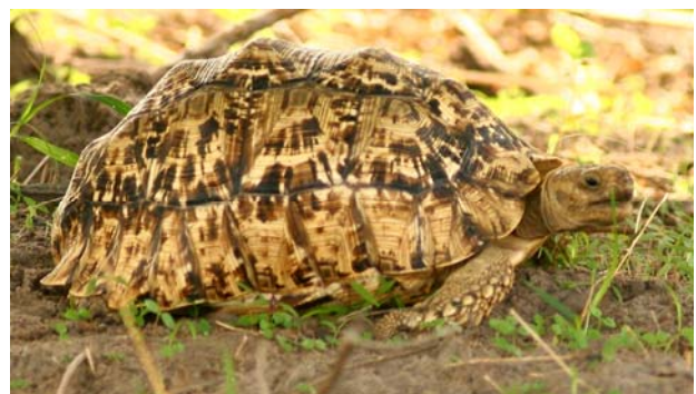
Fig. 4: Leopard tortoise, Stigmochelys pardalis from Botswana