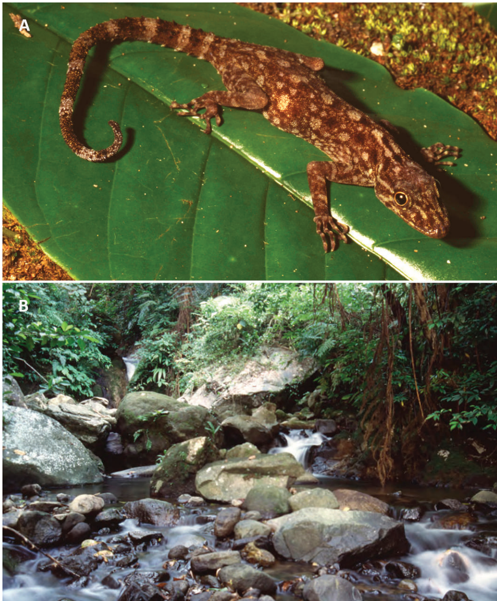
FIG. 1.—(A) Adult female holotype of Cnemaspis rajabasa MZB 6595; SVL 57.4 mm); and (B) habitat of C. rajabasa : Tajur Stream on the southern slopes of Gunung Rajabasa, Lampung, Sumatra; elevation 425 m above sea level, 15 June 1996. Image shows boulders where specimens of the type series of the new species were found. Photos by E.N. Smith. (UTA slide collection-29066, UTADC-8171, and UTADC-8172). Color versions of these images are available online.

Whereas C. rajabasa has 20–21 paravertebral tubercles, Cnemaspis pemanggilensis Grismer and Das 2006 (76.0 mm) has 30–37 paravertebral tubercles.