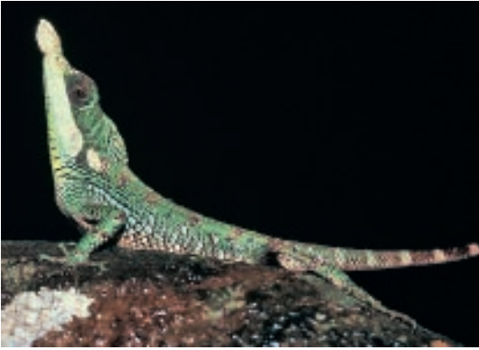
Plate 2. Sri Lankan Leaf-nosed Lizard Ceratothrauda tennenti , mature male, March 2006.