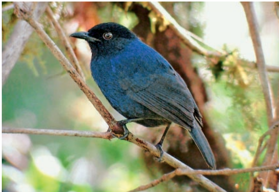
Plate 1. Sri Lanka Whistling Thrush Myophonus blighi , mature male, March 2006.

After this treatment the bird released the dead prey and rested for about a minute, then caught the lizard by the snout, ventral side upwards, and