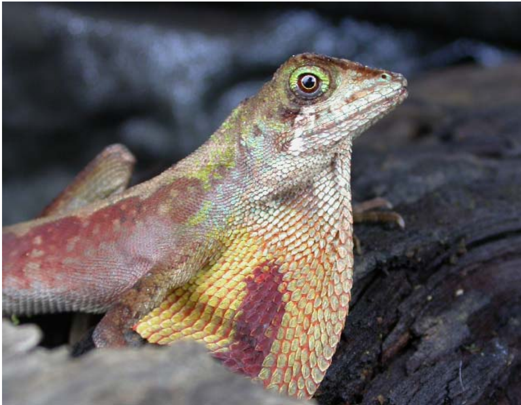
FIG. 1. A mature male of Otocryptis wiegmanni while expanding its dewlap. Macho adulto de Otocryptis wiegmanni expandiendo su saco gular.

1992). The amount of leaf litter on the ground was thick and wet. The canopy cover is about 70% and the undergrowth was very poor. The soil is soft and it contains blackish brown earth. The dominant tree species are Madhuca fulva (Family: Sapotaceae), Mangifera zeylanica (Family: Anacardiaceae), Dipterocarpus zeylanicus (Family: Dipterocarpaceae), Mesua ferrea (Family: Clusiaceae), and Shorea zeylanica (Family: Dipterocarpaceae).